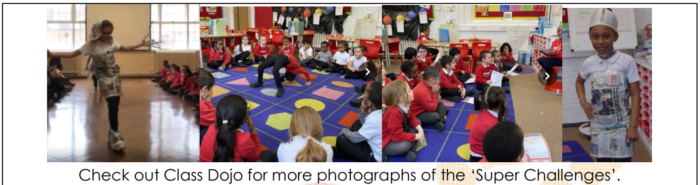
Check out Class Dojo for more photographs of the 'Super Challenges'.

Dear Winton Families, We have had a SUPER week completing all the challenges.